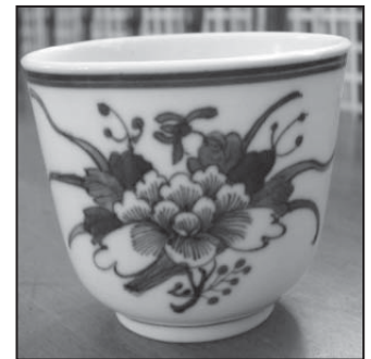
Answers on back cover