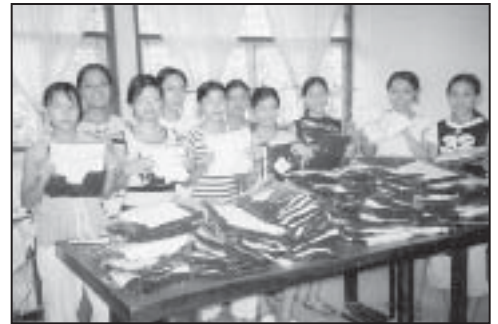
Children in Vietnamese orphanage receive new uniforms thanks to PSBIV and Powers funding.

Through the support of the Powers Foundation funding, orphanages are now equipped with sports equipment including badminton sets, swings, and ping-pong tables to encourage and improve living conditions for children. Additionally, 104 orphaned adolescents have been taking vocational training courses on sewing, embroidery, and drawing, providing them with skills that will enable them to earn a living after graduation from the orphanage.