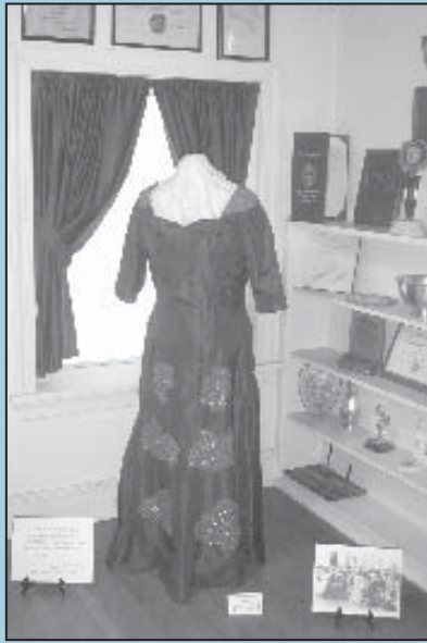
During the 'Personal Pearl' exhibit at the Pearl S. Buck House, beautiful gowns worn by the author were featured.

Visitors, volunteers & staff have enjoyed exploring aspects of Pearl S. Buck's life and times in depth through a series of changing thematic exhibits. The celebration of the 75th Anniversary of the publication of The Good Earth in March and April, was very popular and attracted both television and newspaper recognition. Every room on the tour was in bloom during the Festival of Flowers in May and June. A variety of arrangements were contributed by local florists and members of the Pearl S. Buck Volunteer Association. Personal Pearl featured suits, gowns, hats, gloves & purses worn by Pearl Buck matched when possible with photographs of the author in the garments. Many visitors were delighted for the opportunity to share a more intimate sense of this world famous woman. The fourth exhibit, Political Pearl will run from September to October and will examine through her own words, the author's work as an activist. The Holiday House – Festival of Trees running from November 7th – December 31st will include several trees inspired by Pearl Buck's writings. Look for a unique interpretation of Pearl Buck's writing on food, her own cookbook collection in the kitchen, and a tree decorated to honor the 75th Anniversary of The Good Earth .