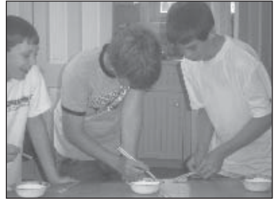
Students on a tour of the Pearl S. Buck House have a lesson in using chopsticks practicing with goldfish crackers.

Students aren't the only ones commenting on the rich new experience of a Pearl S. Buck Historic Site visit. A few teachers remarked, The day you've created sounds absolutely perfect...and thank you for such a good day at the Pearl Buck House... [and] for taking such personal care of us.