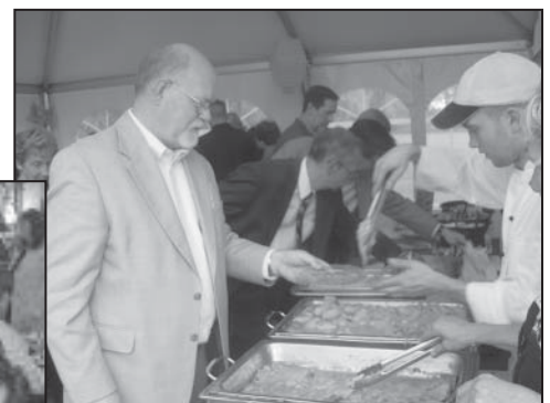
Top: There was something to eat for everyone at 'A Taste of the World' with 24 participating vendors. Left: Guests actively bid on over 20 items at our live auction.