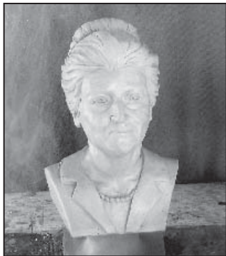
Pearl S. Buck clay bust, to be cast in bronze for the 2006 Woman of the Year Award.

This spring, Pearl S. Buck International was informed by the White House that First Lady Laura Bush was “pleased to accept” the 2006 Pearl S. Buck Woman of the Year Award. This award is given to women who make outstanding contributions in the areas of cross-cultural understanding, humanitarian outreach, and improving the quality of life and expanding opportunities for children around the world. Past recipients of this award include such distinguished and accomplished women as Audrey Hepburn, Toni Morrison, Corazon Aquino and Lee, Hee-ho.